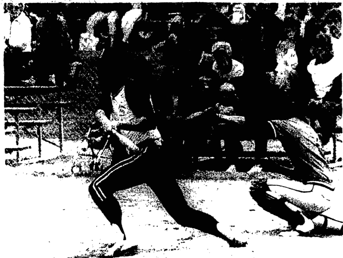
Though K & D Furniture never did make it to the final four, this batter got a solid piece of the ball for a single. Fourteen teams were present at the June 9-10 tournament sponsored by the Legion Branch #277 and Squamish's K & D Parts managed to post a fourth place finish.

Game two of this private battle was also a barn burner as the Cards advanced to the final with a 3-2 edging, thanks to a two run fifth inning.