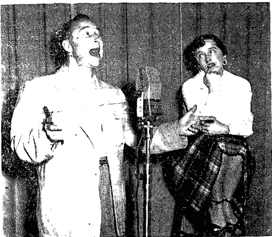
Heard over the CBC