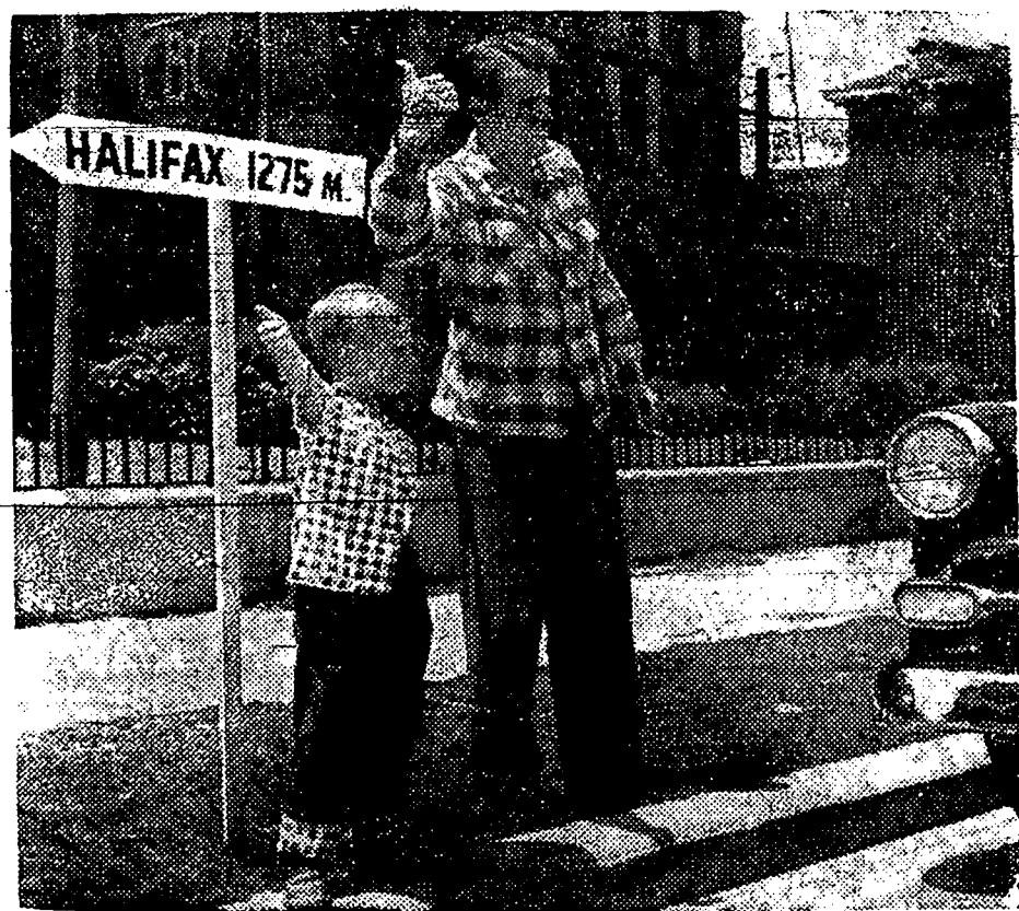
Hearn over the CBC