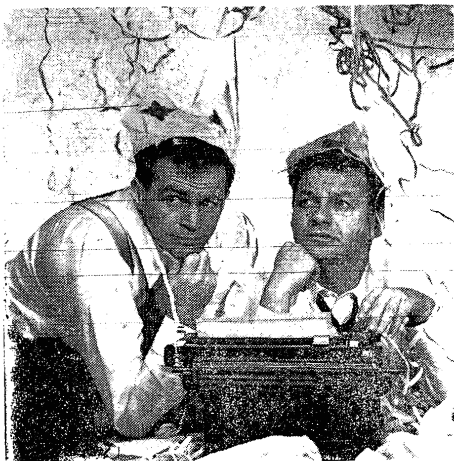
Heard over the CBC