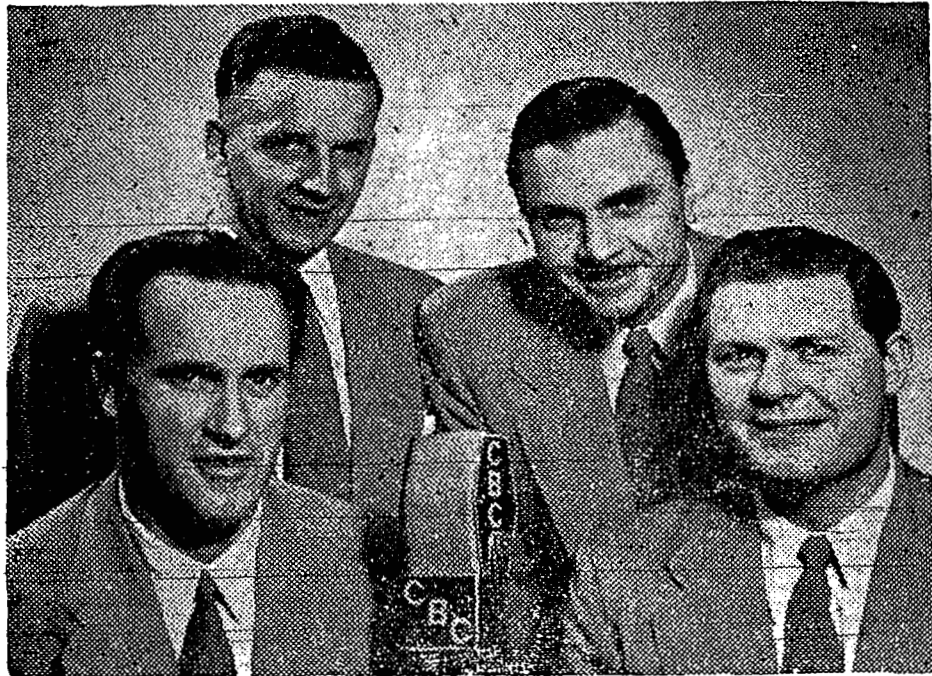
Heard over the CBC