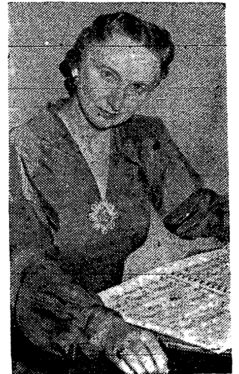
Heard over the CBC