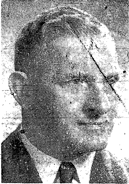
Liberal candidate in Lillooet riding, who ran a close second in Squamish voting.