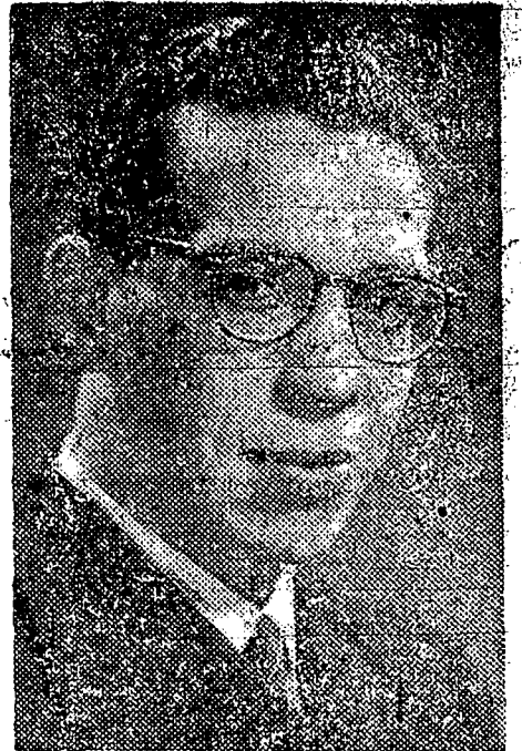
CCF candidate who led in Squamish and is leading in the Lillooet riding on first count.