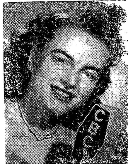
Heard over the CBC