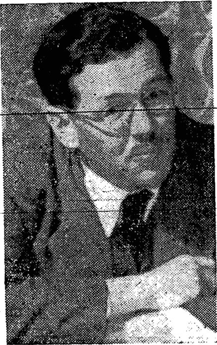
Heard over the CBC