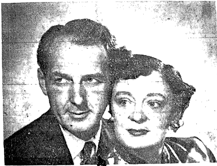
Heard over CBC