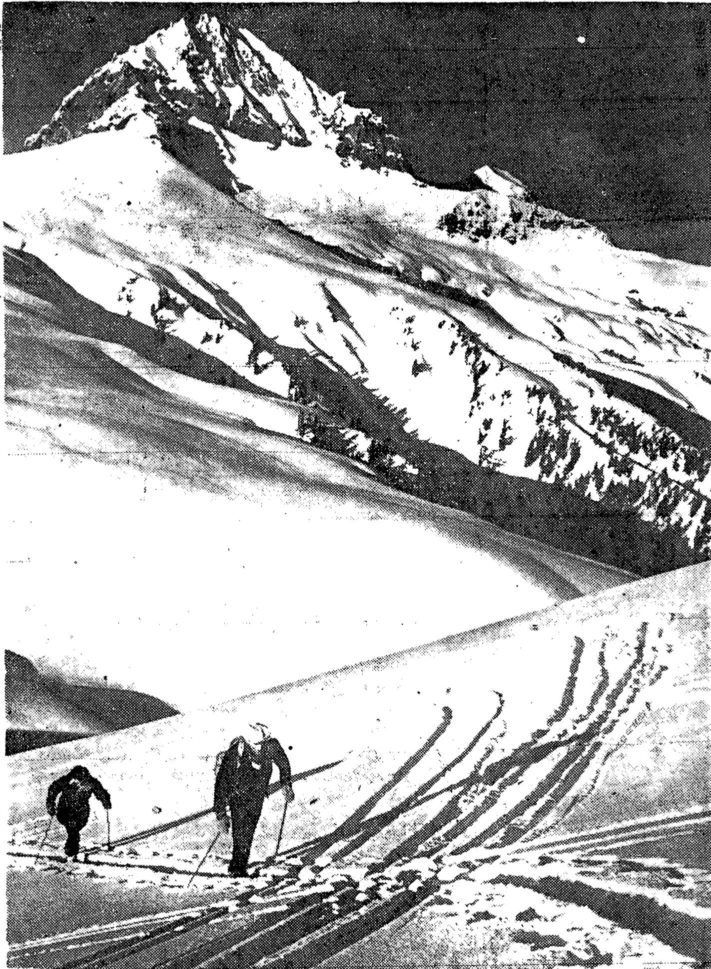
As beautiful in summer as in the winter scene above are these slopes of Mt. Garibaldi, near Diamond Head Chalet.