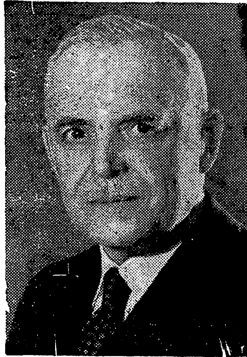
L. S. ST. LAURENT

Prime Minister of Canada, who is now visiting the Pacific coast.