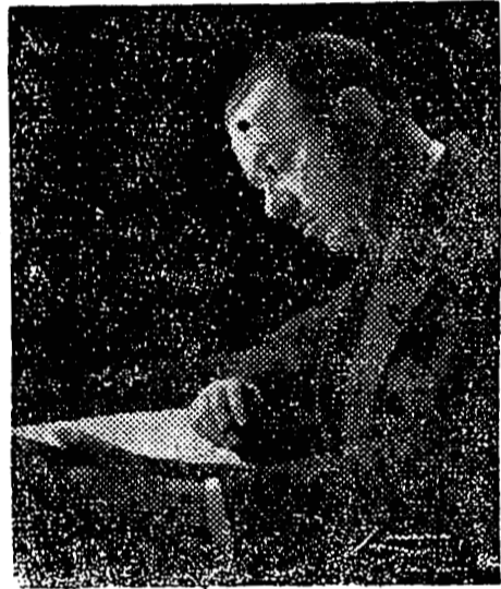
Heard over CBC