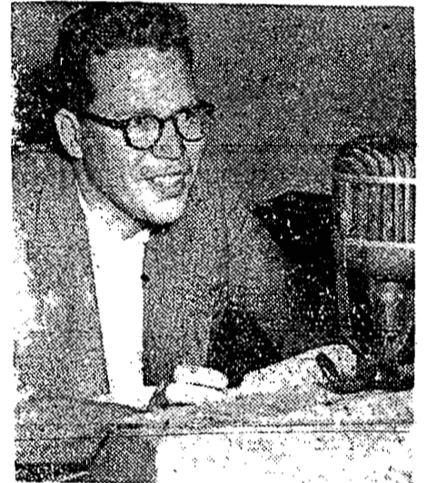
Heard over CBC