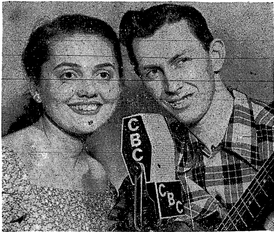
Heard over CBC