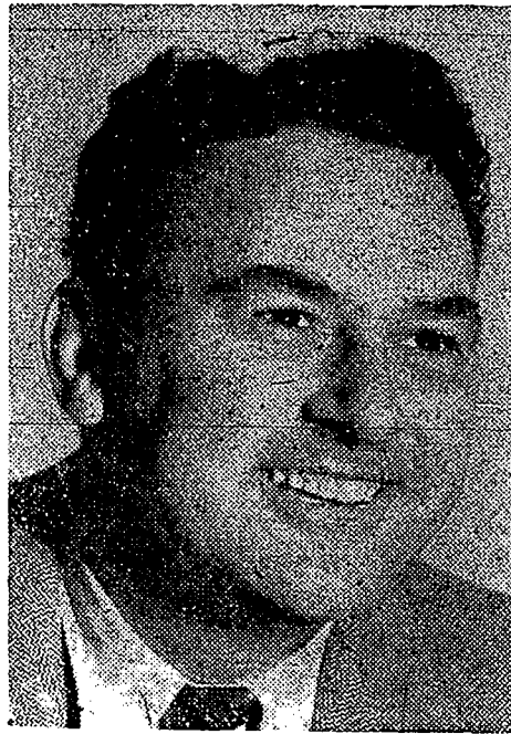
Heard over CBC