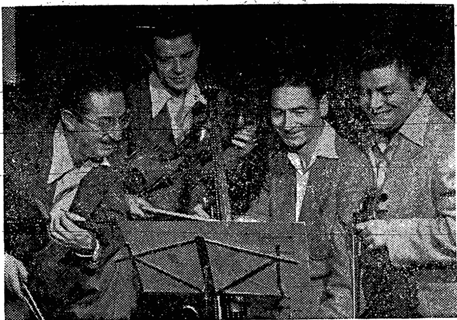
Solway Quartet—Heard over the CBC

We have been appointed representative for