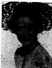
Ruth Springford—over CBC