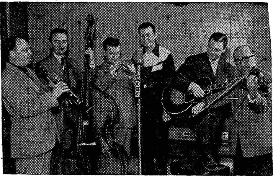
The Western Five Heard over CBC