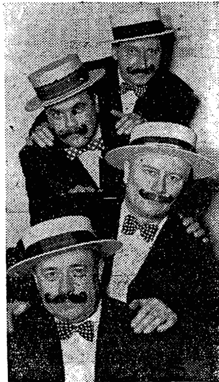
Heard over CBC