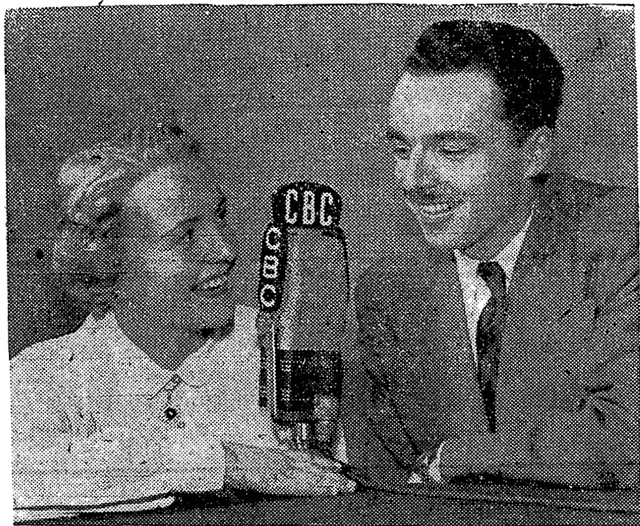
Heard over CBC